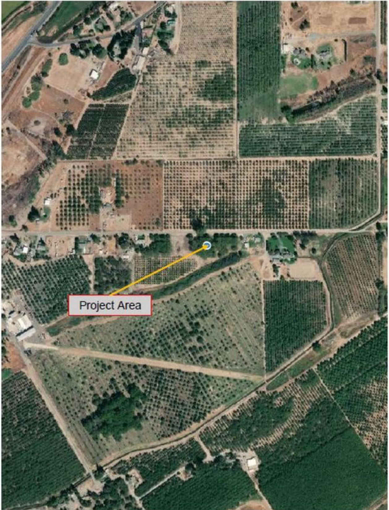
2) Proposed project location map